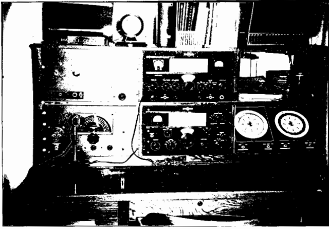
W6DUB - WALNUT CREEK - CAL.