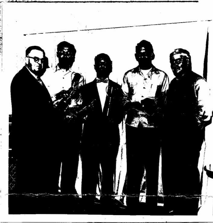
W6TI Chairman of Awards Committee presenting trophies to last year's contest winners. From left to right...W6TI, W6PB(CW) W6PYH(Phone) W6MHB and W6LW (multiple operator)