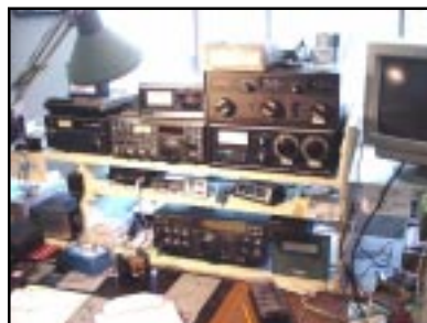
Main Operating Position