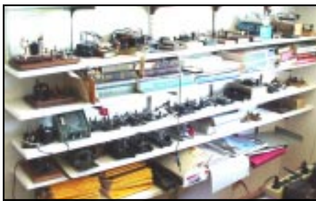
Extensive CW Key Collection