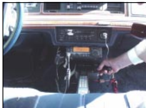
Interior Layout of "Mobile TWO"