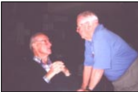
W6ISQ & K6RK Discussing DX