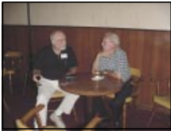
W6YD & KG6AM Discussing DX