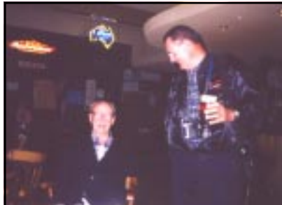
W6ISQ & W6KM Enjoy a Laugh