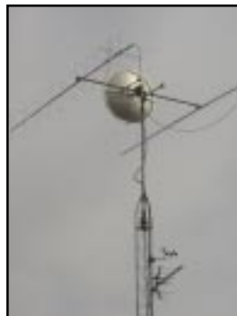
THE ANTENNAS AT AA6G