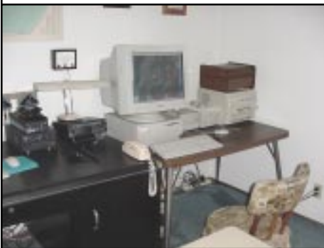
THE MAIN PC AT AA6G