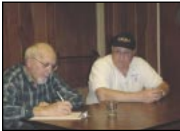
W6VG & W6FDU Compare Notes