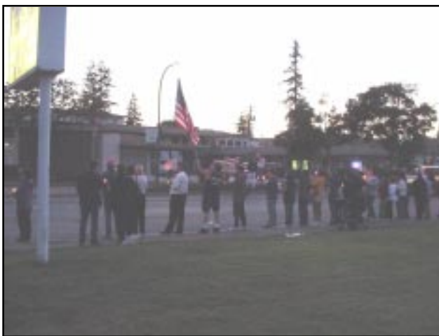
Members of American Legion Post 105 Showing Support for the Victims of the September 11th World Trade Center and Pentagon Tragedies