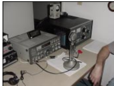
THE HF OPERATING POSITION