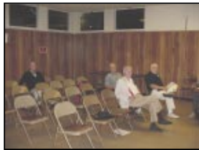
The Early Birds Gather for the Program