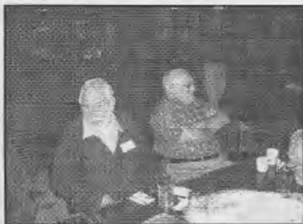
W6WZ & W6JD