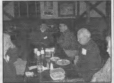
W6WZ, N6SJ, K6YP, KG6AM & WB6ABC.