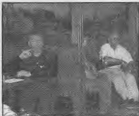
KN6K & K6WIF