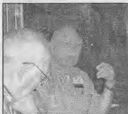
W6VG & W6YD