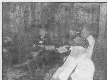
N6SJ, W6TWO & K6WIF