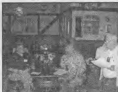
K6YP, KG6AM, W6JD & K6RK