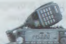
DR-135TP 2M mobile