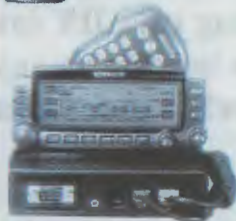
TM-D700A 2M/440 Dualband