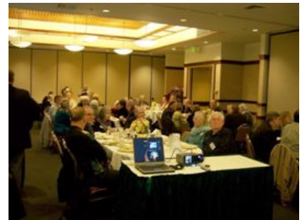
Another view of the beautiful dining room at Michaels.