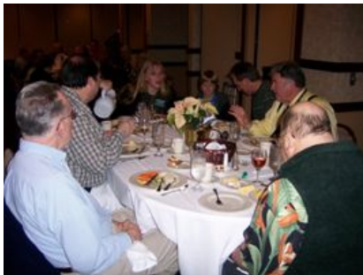
Above you see a group having a great time together.

It is such a pleasure to have the Holiday Luncheon at Michaels’ looking out at the lovely view and as previously everyone was happy with the location as well as with the food. But, of course the greatest part of the event is seeing old friends and their XYL’s whom we may not have seen since last December (2005) or even longer. Some folks came from a great distance which made their presence even more special!