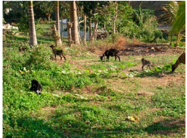
A few goats around for luck ...