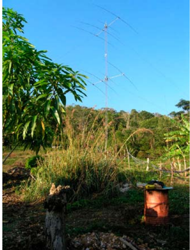
40 Meter Stack