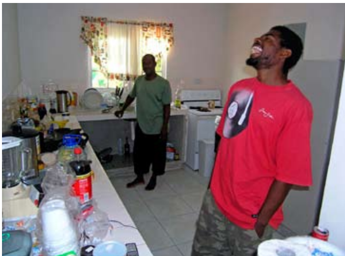
The 6Y1LZ Staff