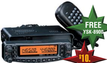
FT-8800R 2M/440 Mobile