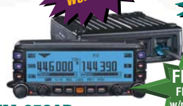
FTM-350AR 2m/440 Dualband