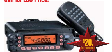
FT-7900R 2M/440 Mobile