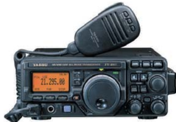
FT-897D VHF/UHF/HF Transceiver