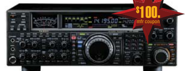
FT-2000/FT2000D HF + 6M tcvr