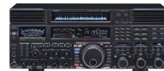
FTDX5000MP 200w HF + 6M Transceiver