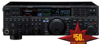
FT-950 HF + 6M TCVR