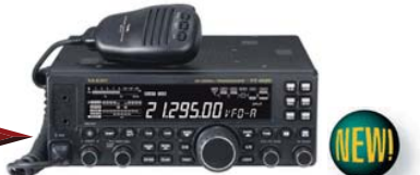
FT-450D HF + 6M TCVR