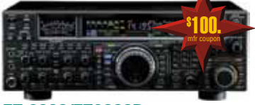
FT-2000/FT2000D HF + 6M tcvr