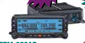
FTM-350AR 2m/440 Dualband