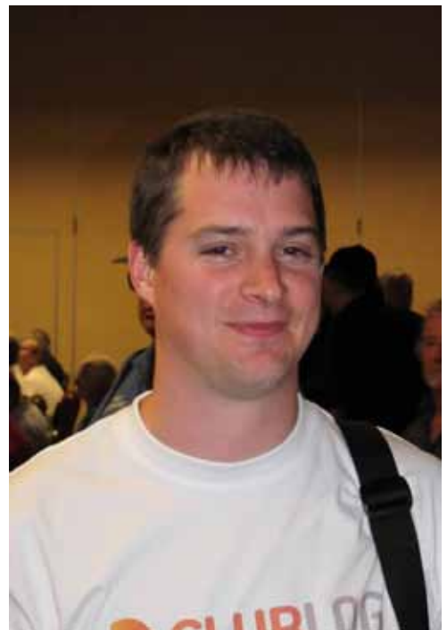
G7VJR - Author of ClubLog