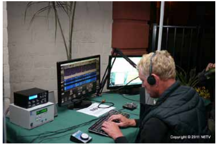
N6DQ Operating Special Event Station N6V