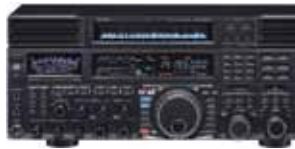
FTDX5000MP 200w HF + 6M Transceiver