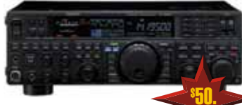
FT-950 HF + 6M TCVR