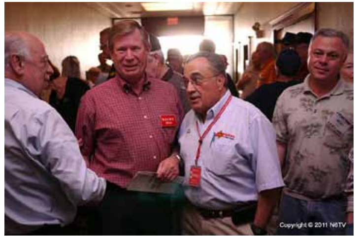
PY5EG/PP5EG, K6IDX, W6RGG, WC6H