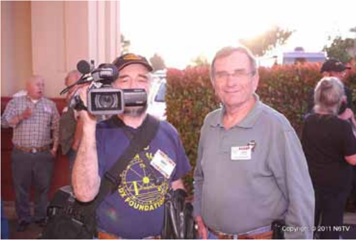
NI6T filming for recuperating NW6P, K6ANP