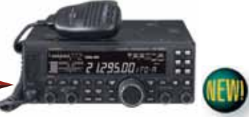
FT-450D HF + 6M TCVR