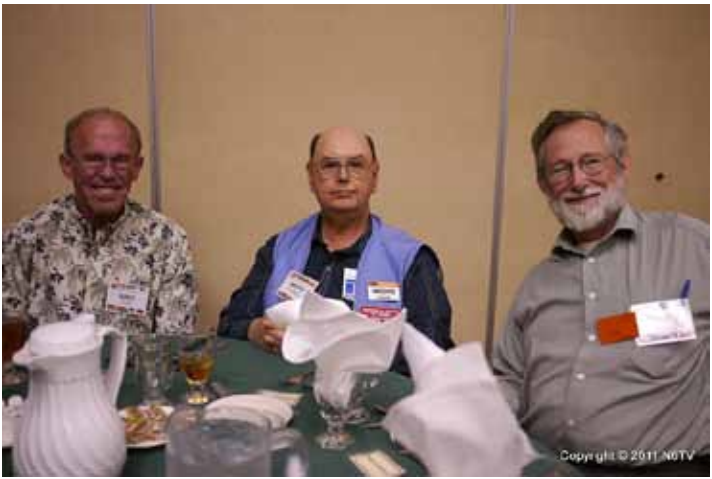
NA6G, W6DPD, K6MI