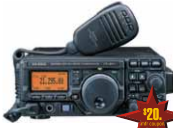
FT-897D VHF/UHF/HF Transceiver