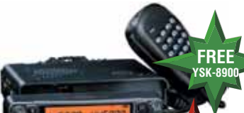
FT-8800R 2M/440 Mobile