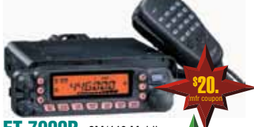
FT-7900R 2M/440 Mobile