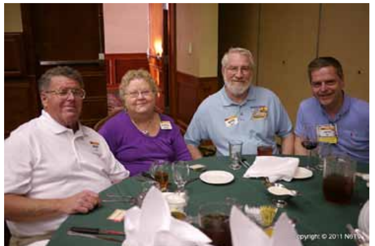
W6NF, K7MKL, K6TD, K6TU