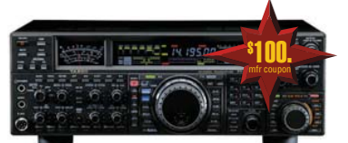
FT-2000/FT2000D HF + 6M tcvr