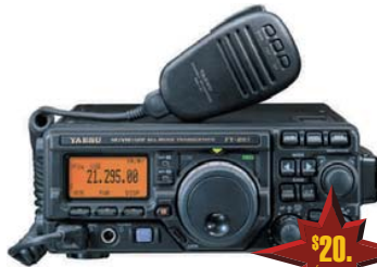
FT-897D VHF/UHF/HF Transceiver