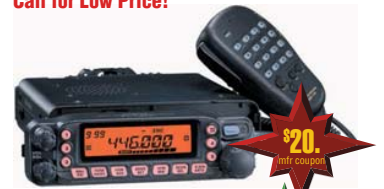
FT-7900R 2M/440 Mobile