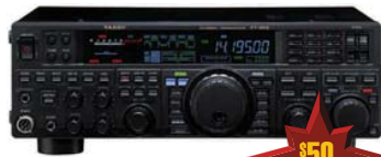
FT-950 HF + 6M TCVR