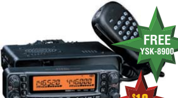
FT-8800R 2M/440 Mobile